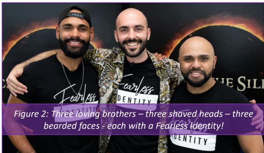
Figure 2: Three loving brothers – three shaved heads – three bearded faces - each with a Fearless Identity!

To Donate to Core Issues Trust: Sort Code 20 62 23: Account 20833061 | Contact: +44 (0)7833098998 Donate to CIT using your own card on PayPal link . Donate to IFTCC using your card on PayPal link .