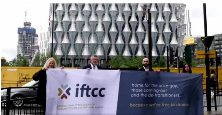
Figure 4: Friends of the IFTCC outside the USA Embassy

Download a free copy of the IFTCC’s Response to the Ozanne Foundation’s “Faith and Sexuality” Report - click the image, right