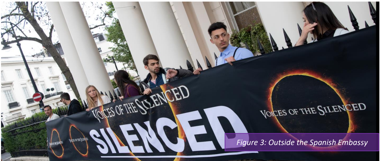
Figure 3: Outside the Spanish Embassy